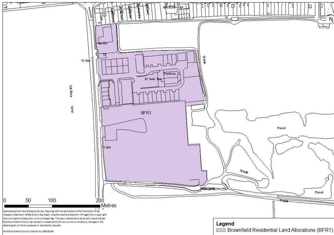
Figure 3 –BFR1 - Star Lane Industrial Estate, Great Wakering (Page 19) Brownfield Site Comprising: - Industrial Estate North – present Industrial Estate Industrial Estate South – former Brickworks site